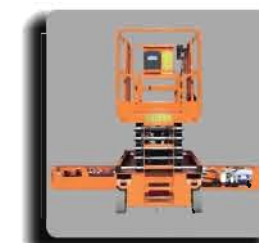
Swing Out Tray