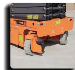
Compact Turning Radius