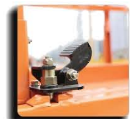
Platform Extension Footlock